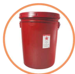
Labeling Grease Pails