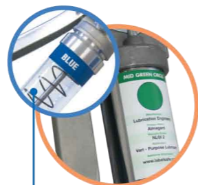
Labeling Grease Guns

Please visit our website for a selection of color-coded grease guns.