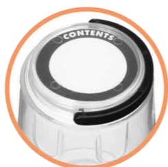
Labeling Grease Protection Tubes

Please visit our website for a selection of color-coded grease guns.