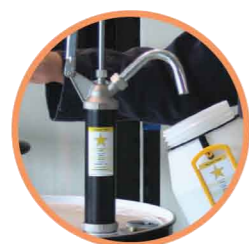
Labeling Drum Pumps