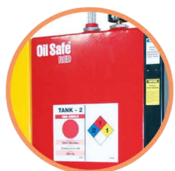
Labeling Bulk Storage