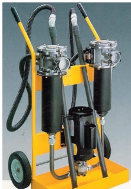
Figure 6. Portable filter cart.

Offline recirculating (“kidney loop”) filtration systems can be very effective in achieving and maintaining your cleanliness targets. In some cases, a permanent installation is called for, with continuous sidestream (“bypass”) filtering. In less critical applications, where sump volumes are usually smaller, the job can often be handled with a cart-mounted portable filtration system (Figure 6). Portable cart-mounted systems can be used at