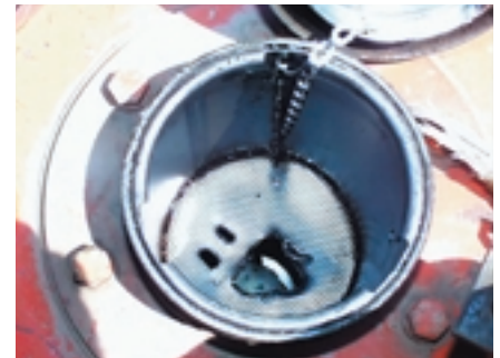
Figure 3. Poor handling practices – filler neck screen punched out.

Many improvements to your filtration, storage, and handling procedures can be made with minimal cost. A little time spent simply reviewing your current storage and handling procedures can be revealing (and in some cases, even shocking ). Figures 3, 4, and 5 illustrate a few problems commonly seen in many operations. During the