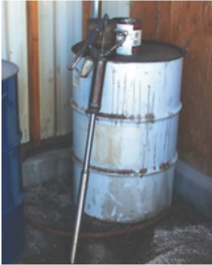
Figure 5. Poor handling practices – dirty fill pump.

evaluation phase, it is important to identify contamination sources as well as the levels. Contamination sources may include: