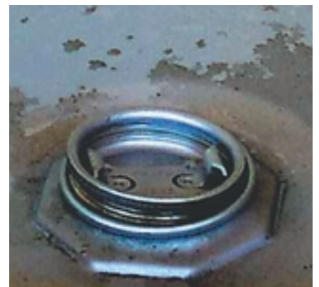
Figure 4. Poor storage practices – loose bung (drum cap).